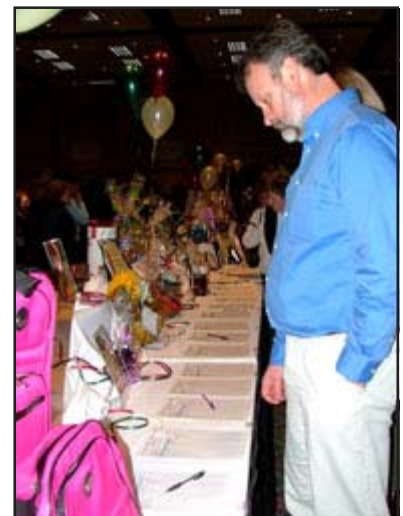
Silent Auction Table

Tickets are $50 per person and are on sale now at the Meals On Wheels office at the Central District Health Department. Call 208-327-7460 for pricing information on business tables and corporate sponsorships. Hurry and get your tickets now – only 700 tickets are available.