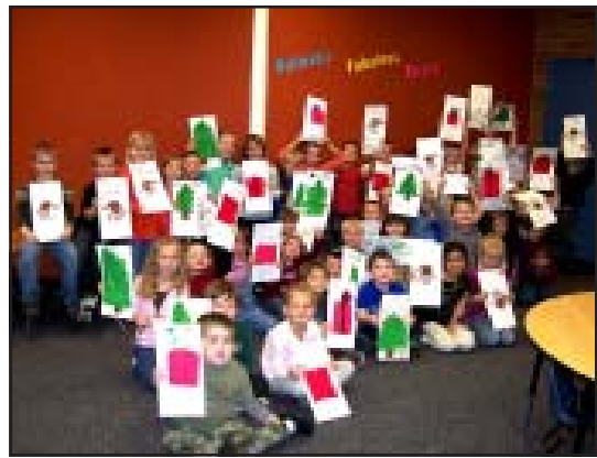
Lake Hazel Elementary First Graders

Donations from the community included such items as sample- and hotel-size hand lotion, shampoo and conditioner; postage stamps, stationary and cards, lip balm, small travel-size packages of tissue, candies, ornaments, packages of tea and hot cocoa, and food items like oatmeal, soup, fruit cups, and granola bars.